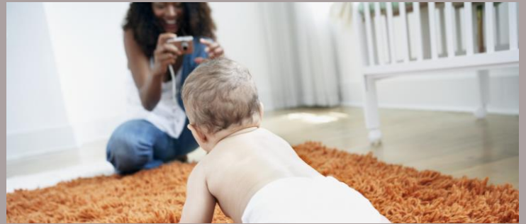
You can make a difference

In communities throughout the country, civic groups, churches, businesses and concerned citizens organize diaper drives to collect diapers for donation to local diaper banks. Diaper drives are a great way to engage your family, friends, neighbors and co-workers in the fight against diaper need. They are also an important tool for educating your community about diaper need and helping give voice to this silent crisis.